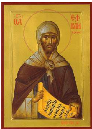
Saint Ephrem, pray for us!

Please return your pledge card to the Rectory this week or place it in the collection during mass. If you have any questions, please call the Rectory at (718) 833-1010.