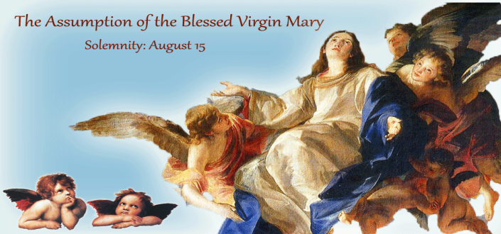
The Assumption of the Blessed Virgin Mary Solemnity: August 15

"...let your adornment be the inner self with the lasting beauty of a gentle and quiet spirit, which is very precious in God's sight." 1 Peter 3:3