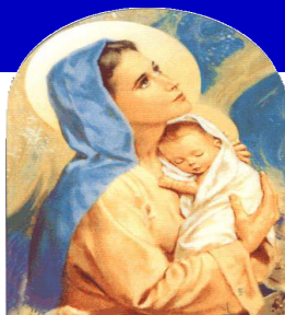
Holy Mary, Mother of God, Pray for us!