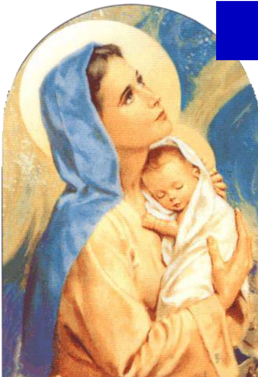
Holy Mary, Mother of God, Prayer for us!

For information please contact the rectory.