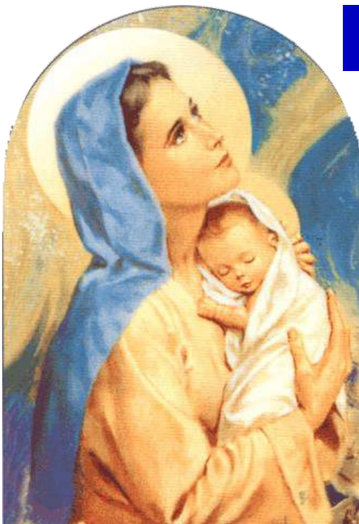
Holy Mary, Mother of God, Prayer for us!

For information please contact the rectory.